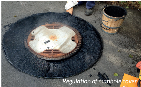
Regulation of manhole cover