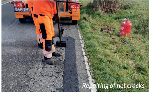
Repairing of net cracks