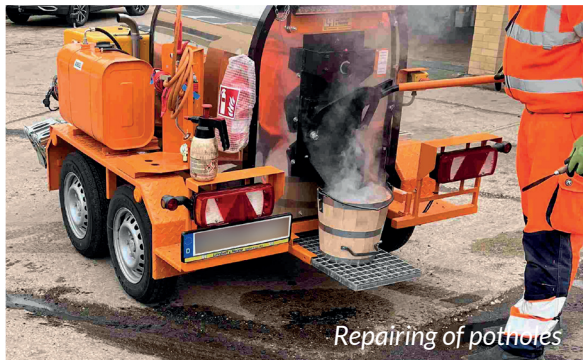
Repairing of potholes