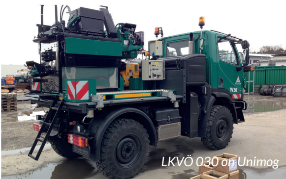
LKVÖ 030 on Unimog