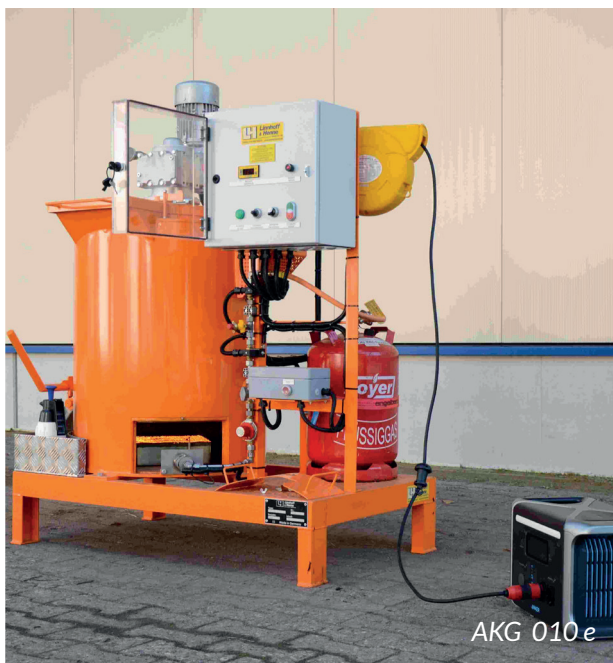
AKG 010 e

Potholes, net cracks and ruts are not only annoying, but also pose a considerable safety risk. Fast and durable repairs are therefore essential. With our machines for processing of hot mixture, damaged road surfaces can be repaired in an efficient and sustainable manner. Whether spot repairs or large-scale rehabilitation – our technology ensures safe, rapid and high-quality preparation of the mixture.